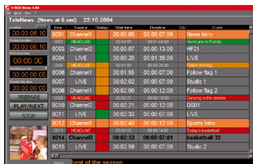
V-BOX News playback interface